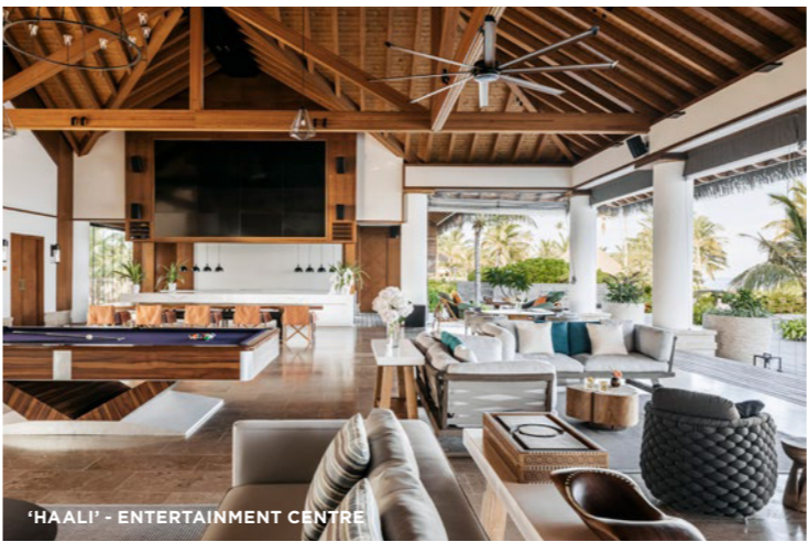
'HAALI' - ENTERTAINMENT CENTRE