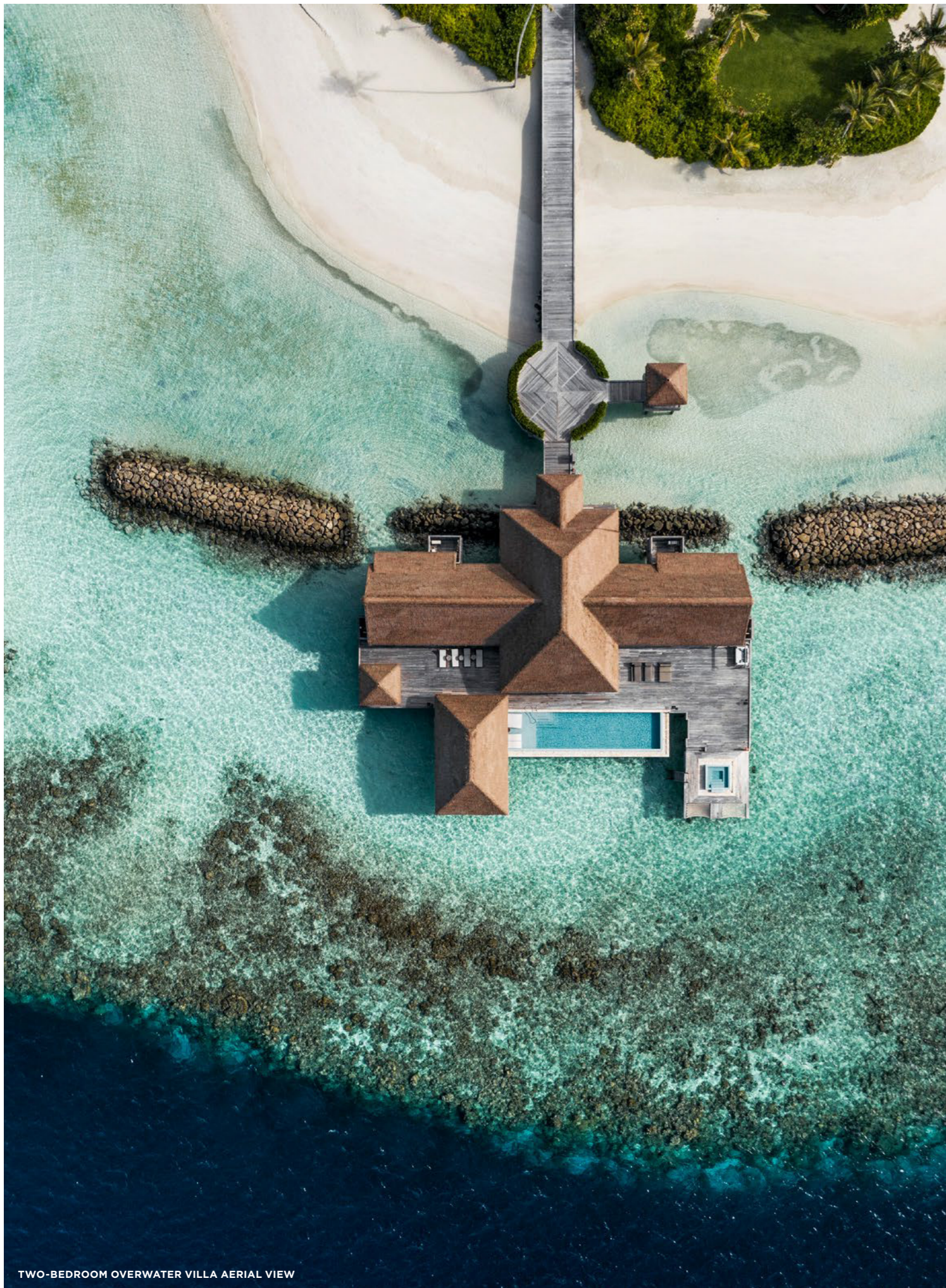
TWO-BEDROOM OVERWATER VILLA AERIAL VIEW