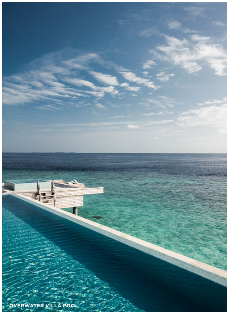
OVERWATER VILLA POOL