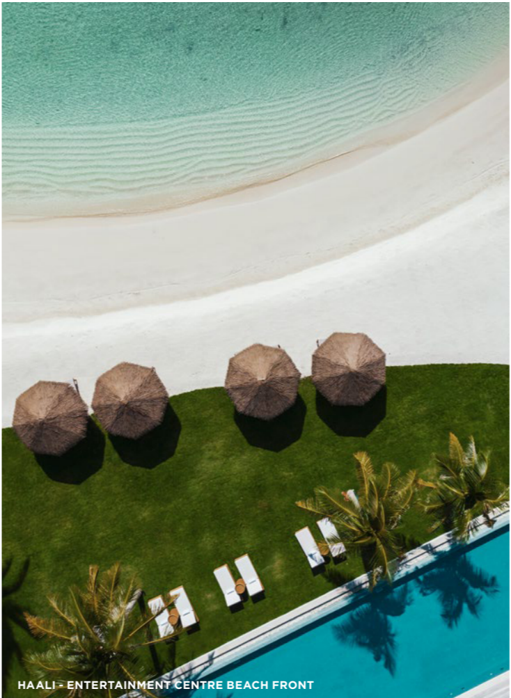
HAALI - ENTERTAINMENT CENTRE BEACH FRONT